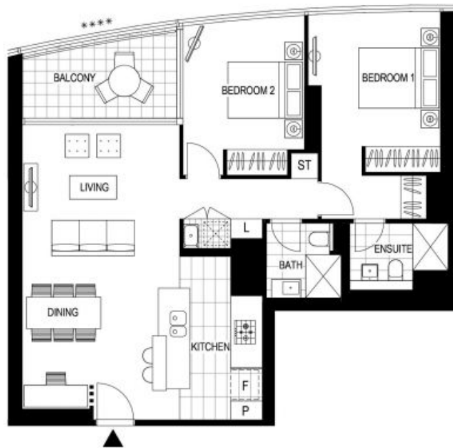
LEVEL 9, 10, 11, 12, 13, 14, 15, 16, 17, 18, 19, 20, 21, 22, 23, 24, 25, 26, 27, 28, 29, 30, 31, 32