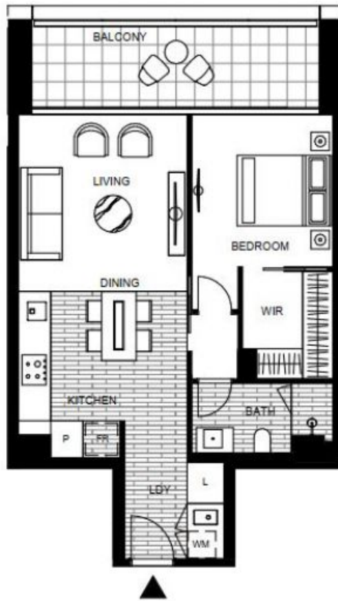
LEVEL 7V, 8V, 9V, 10V